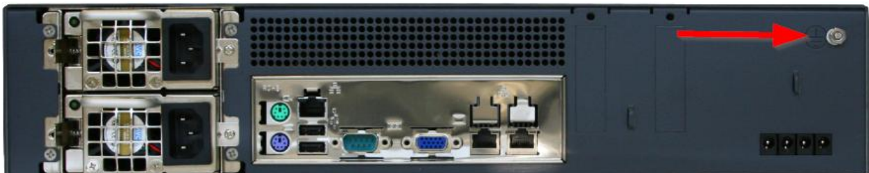
Figure 1: Grounding Screw on Blue Steel Rear Panel