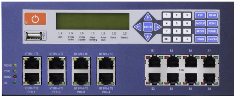
Fig. 2 – BRI/PRI Panel (allows up to additional 24 FXS ports)

These are models that have at least one digital PSTN port – ISDN BRI or PRI. They have a vertical array of four status indicators on the left side of the front panel ( Fig 2 ).