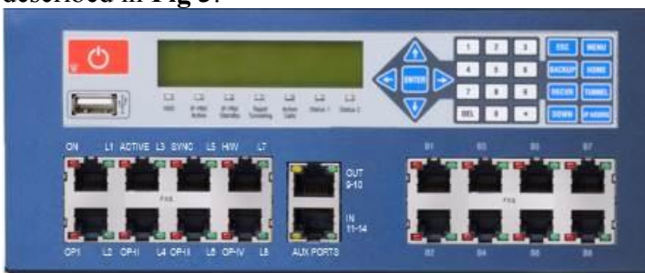
Fig 3. All-Analog Panel

These models do not have digital modules and therefore have a different set of indicators, as described in Fig 3 :