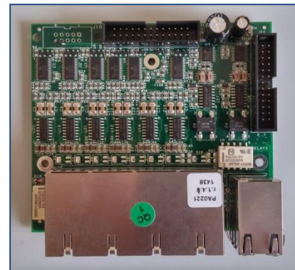
XR0126 Top View