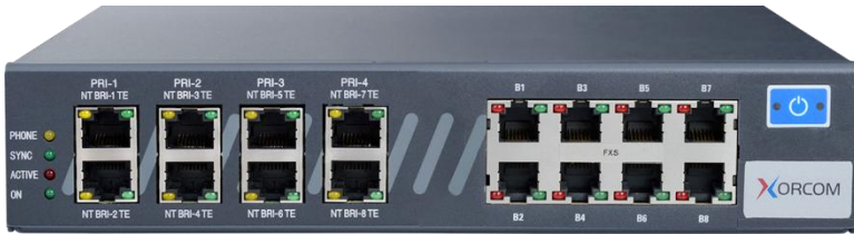
Fig. 2 – PRI/BRI Panel (pictured with additional optional 8 FXS or 8 FXO ports)