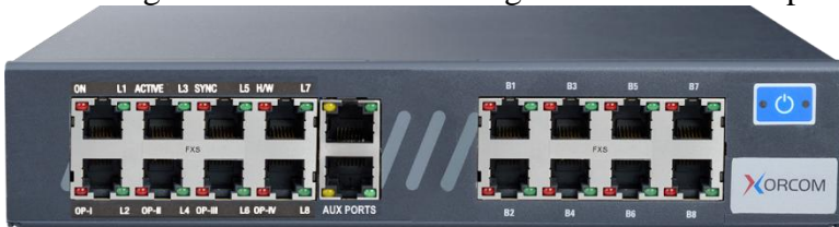
Figure 3: Spark CXS1000 with 16 analog ports and I/O ports

Note: Analog ports also have a red LED but this LED is never used to show line activity.