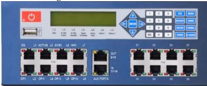
Fig 3. All-Analog Panel

These models do not have digital modules and therefore have a different set of indicators, as described in Fig 3 :