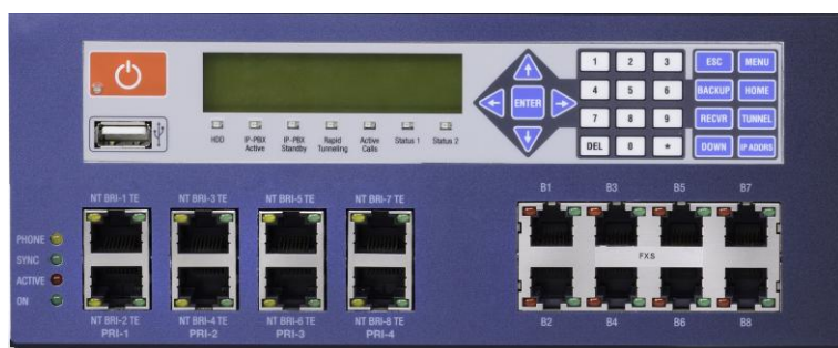
Fig. 2 – BRI/PRI Panel (allows up to additional 24 FXS ports)

These are models that have at least one digital PSTN port – ISDN BRI or PRI. They have a vertical array of four status indicators on the left side of the front panel ( Fig 2 ).