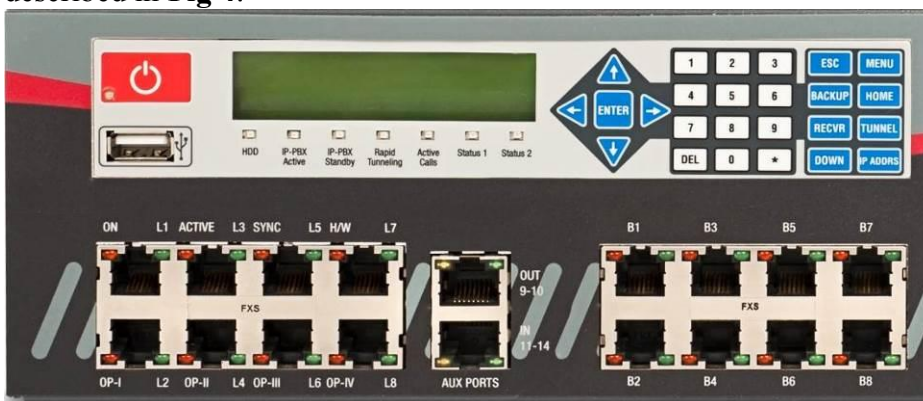
Fig 4. All-Analog Panel

These models do not have digital modules and therefore have a different set of indicators, as described in Fig 4: