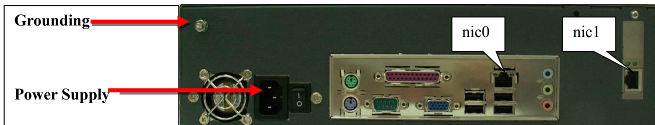
Figure 1: Detail of CXE2000 Rear Panel