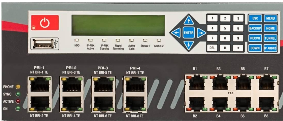
Fig. 3 – BRI/PRI Panel (allows up to additional 24 FXS ports)