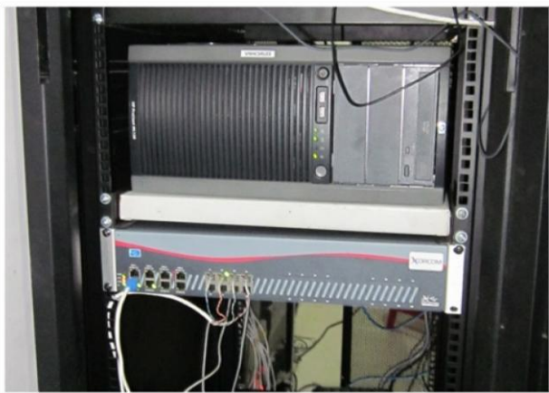
Xorcom XR3057 installed at Lazada Viet Nam