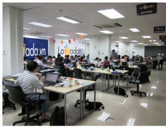
Lazada Viet Nam head office