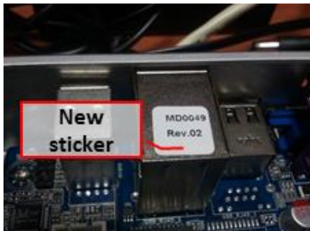
Figure 1: New revision sticker on motherboard.

The reset card is a small board connected to motherboard's F_PANEL1 front panel connector. It provides a reset power up pattern that ensures that the motherboard will start properly after a short electricity outage.